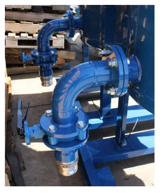
2. Quick-Fill Connections BOTTOM