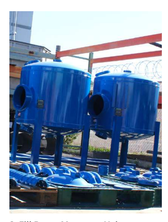
3. Fill Ports, Manways, Yokes & Couplings