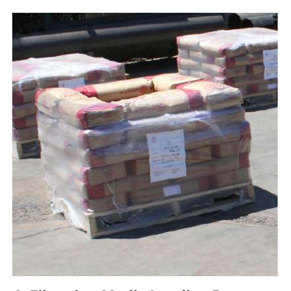
4. Filtration Media Loading Prep

Continue Loading Process by Installing (GAC) Media Into Tank, Referencing Desired Volume Per Tank.