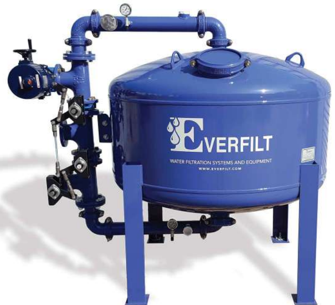
New Everfilt® 54-24-1A Media Filter System (Part of Los Angeles)