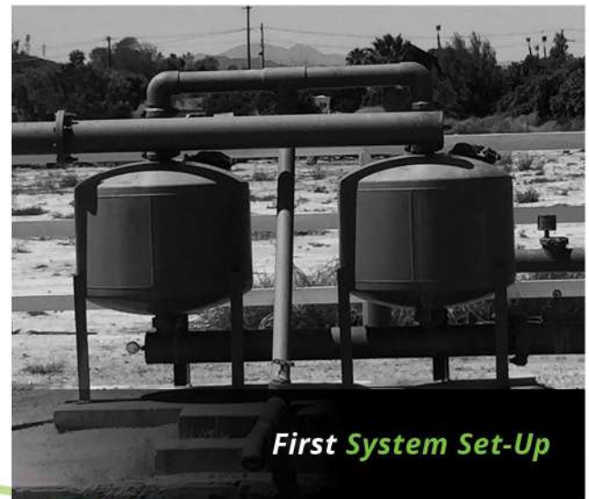
First System Set-Up